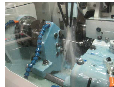
通过螺纹磨床进行的高精度螺纹槽加工 High accurate shaft groove process by Grinding machine

本公司的滚珠丝杠生产工序因客户的精度要求而异。大体可分为采用研磨加工制成的高精度精密滚珠丝杠和采用滚丝模形成螺纹槽的冷轧滚珠丝杠。C5以上精度等级的滚珠丝杠一般采用研磨加工(精密滚珠丝杠),C7、C10级的滚珠丝杠则采用冷轧加工。对于无滚丝模(冷轧加工模具)的型号,也可采用研磨加工生产C7、C10级产品。