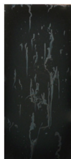
Sample A 试样A