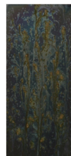
Sample B 试样B