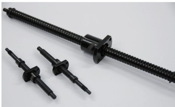
照片 A-111 : 黑铬处理品 Photo A-111 : Black Chrome coating